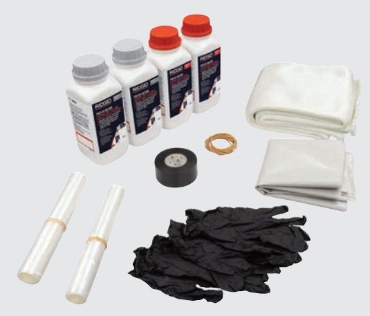
Catalog No: 74718