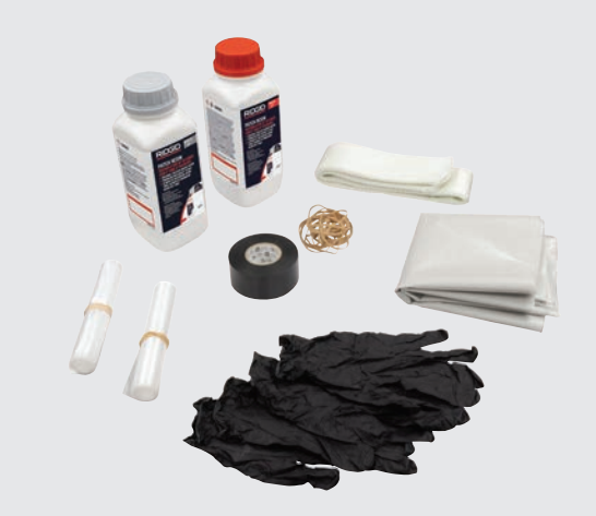
Catalog No: 74698