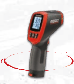
micro IR-100 Non-Contact Infrared Thermometer