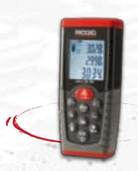
micro LM-100 Laser Distance Meter