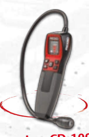
micro CD-100 Combustible Gas Leak Detector