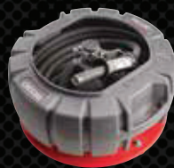
SECTIONAL CABLE CARRIER Cat. # 61708

The new sectional cable carrier lets you transport cables in and out of the jobsite faster and cleaner. A sturdy base keeps the carrier secure, so you can spin sectional cables in or out of the housing unit efficiently. The carrier keeps soiled cables contained to mitigate jobsite contamination.