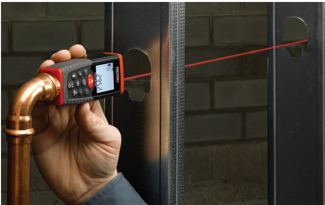
Obtain quick measurements in tight spots with the LM-100