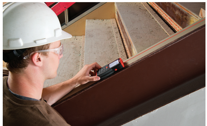
Angle measurements are made easy with LM-400