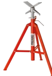
V-Head Pipe Stands