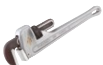
Straight Aluminum Pipe Wrenches