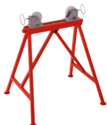
Adjustable Stand with Steel Rollers