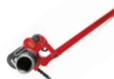
Compound Leverage Wrenches