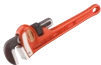
Straight Heavy Duty Pipe Wrenches