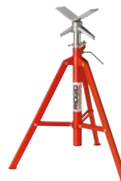
V-Head Pipe Stands