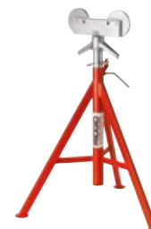
Roller Head Pipe Stands