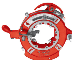
No. 714 & No. 914