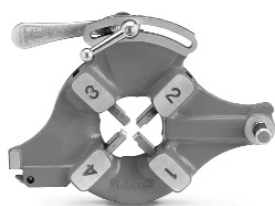
No. 713 & No. 913