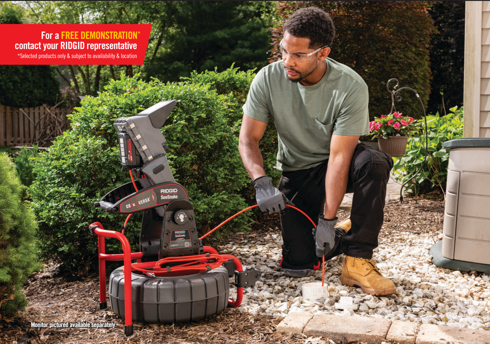
Monitor pictured available separately.

*Selected products only & subject to availability & location