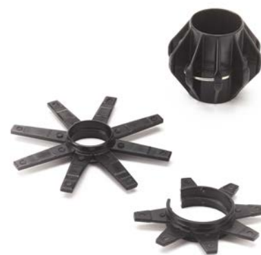
Set of 30 mm Pipe Guides included with SeeSnake Mini reel