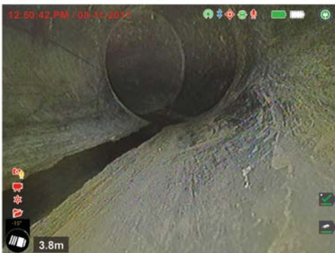
HDR IMAGE & TiltSense™