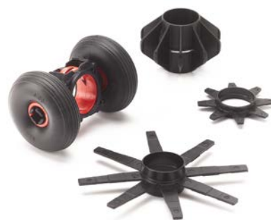
Set of 35 mm Pipe Guides included with SeeSnake Standard reel