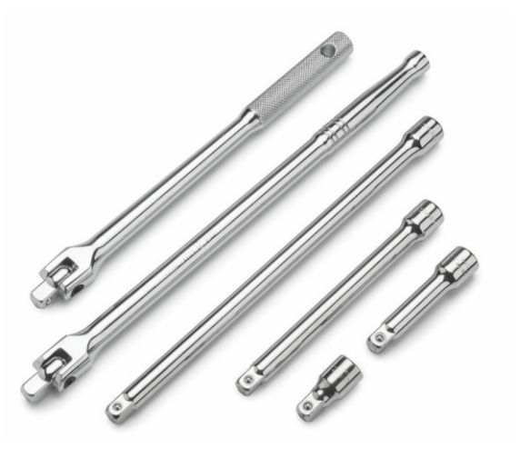
Optional accessories (not included): for use in place of T-Handle.