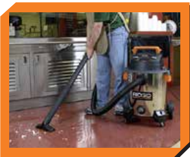
Dry Pick-up - Workshop, Garage etc.