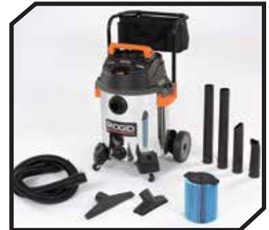
Vac with Accessories & Filter