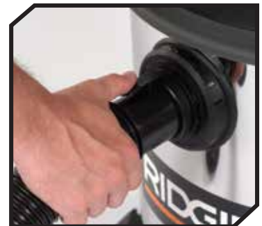
Dual-Flex™ Locking Hose