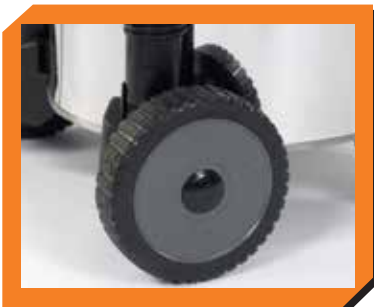
Rear Wheels- Rough Terrain Mobility