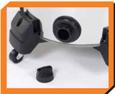
Large Drain for Emptying Water