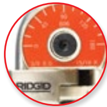
Clearly Visible Degree Marks for Accurate Bending