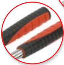
Ergonomic Cushioned Grips, Comfortable Use!

60% Less Force Required vs. Traditional Benders