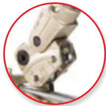
Roller Dies Reduce Force and Tube Flattening