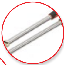
Extra Long Handles, More Leverage, Reduced Force!