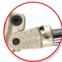
Easy 90° to 180° Switch! No Crossing of Handles!