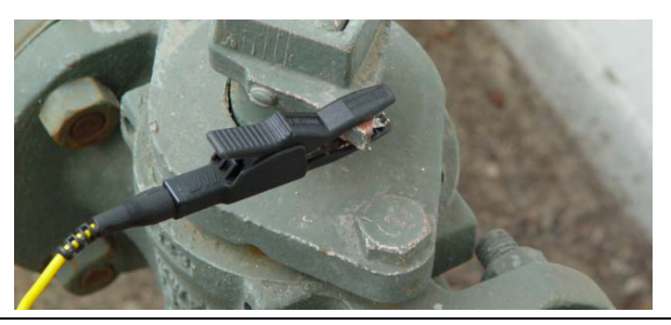
Good contact at the connection point aids current flow.

Solid metal-to-metal contact between the transmitter's clip lead and the connection point is essential for the efficient transfer of signal energy (current). Scrape away any paint, dirt, or corrosion, and work the clip's teeth into the connection point to get good metal-to-metal contact. The better the contact the less resistance there will be to current flow.