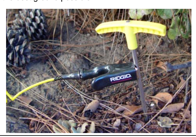
A good ground transfers energy efficiently from the soil to the transmitter, "closing the loop" to create a circuit.

Connecting the transmitter's remaining lead to ground "closes the loop" and completes the circuit. A low-resistance ground is an essential part of your circuit because it helps transfer energy efficiently from the soil to the transmitter with minimal signal loss. See the article on Grounding for tips on getting the best ground possible.