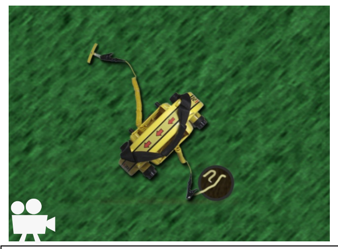
Basic locating circuit. Click image to play video clip.

Electrical current can only flow if a circuit is present. A locating circuit is a closed loop between a transmitter and a conductor. The loop is created when current flows from the transmitter, through the conductor (utility), and then back to the transmitter. The better the circuit,(less resistance) the more efficiently the current can flow, and the stronger the locatable signal. In this article we will explore what makes a good locating circuit for locating underground utilities and how to increase current flow to make locating easier and more accurate.