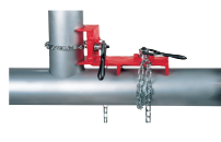
No. 462 Angle Pipe Welding Vise Catalog No. 40225