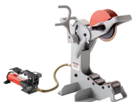
Model 258XL Power Pipe Cutter Catalog No. 58227