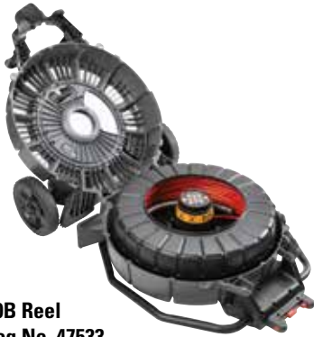
rM200B Reel Catalog No. 47533