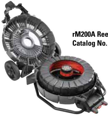
rM200A Reel Catalog No. 42353