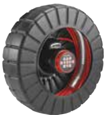
rM200 D2A Catalog No. 47553