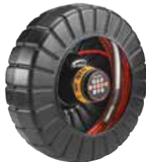
rM200 D2B Catalog No. 47543