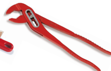
Water Pump Pliers