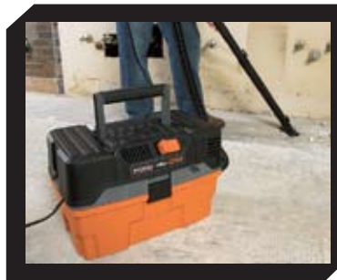
Dry Pick-up - Workshop, Garage etc.