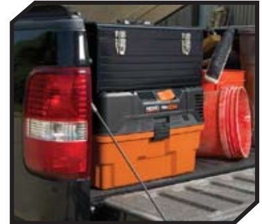
Shape allows easy storing or stacking