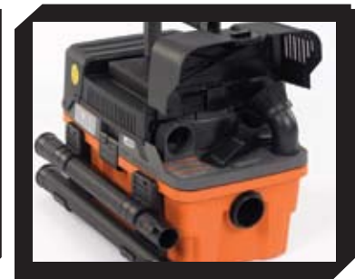
Built-In Accessory Storage