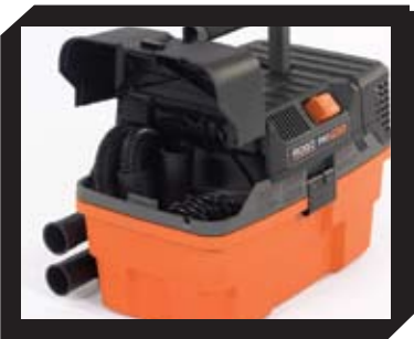
Built-In Hose & Cord Storage