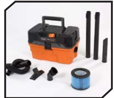
Vac, Filter, Accessories & Hose