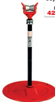
92 Adjustable Pipe Support