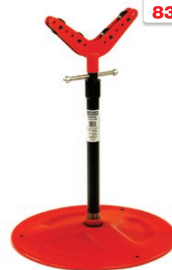
965 Support Stand For Roll Groovers