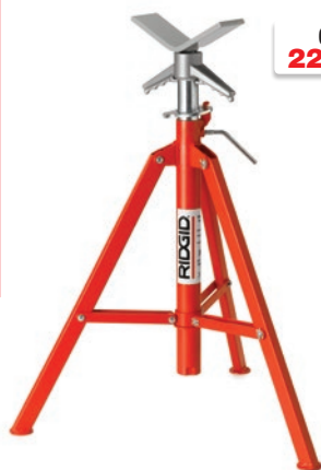
V Head Pipe Stands