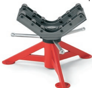
RJ-624 Large Diameter Pipe Stand