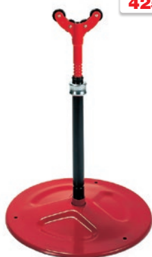
46 Adjustable Pipe Support