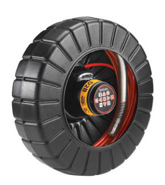
rM200 D2B Drum Catalog No. 47538