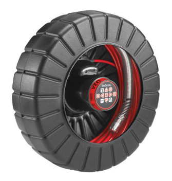
rM200 D2A Drum Catalog No. 47548