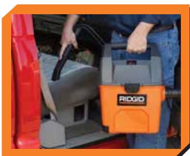
Perfect for Car Clean-up