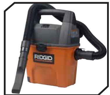
Tug-A-Long® Locking Hose