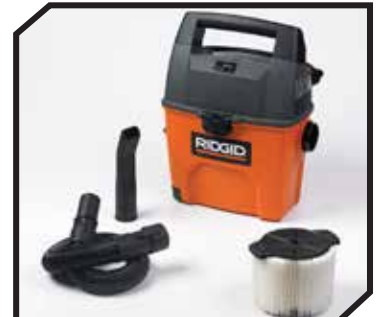
Vac with Accessories & Filter