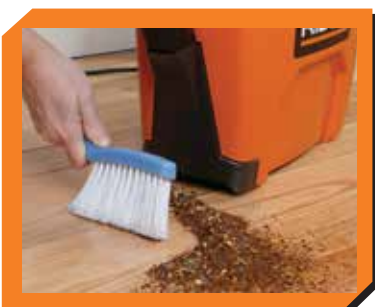
Easy & Convenient Built-In Dust Pan