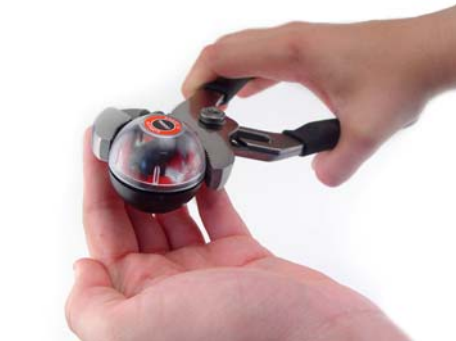
2. Apply light pressure at equator of sonde with pliers to disengage snap.