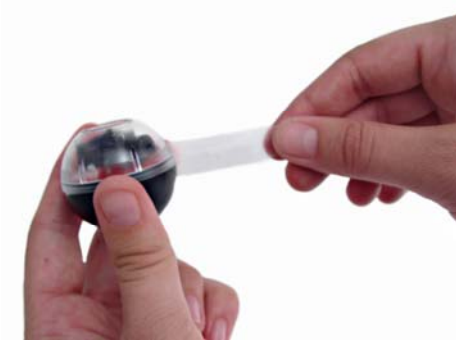
1. Remove tape