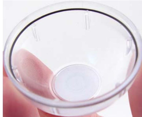
(Properly engaged o-ring)