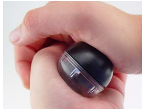
6. Snap shells together and apply new tape around equator.