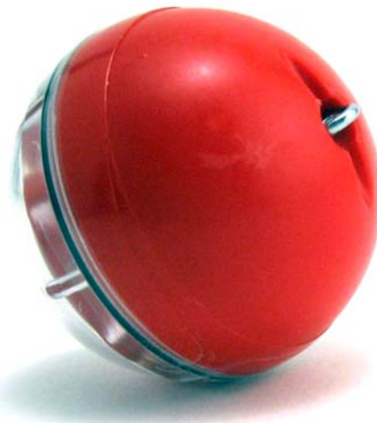
Figure 2 – a string may be attached to the ring on the bottom of the transmitter for retrieval.

During operation of the sonde, the LED will continue to flash.