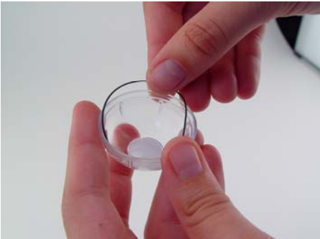
4. Return o-ring to its proper place in top shell.