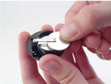
3. Replace both CR2032 battery cells