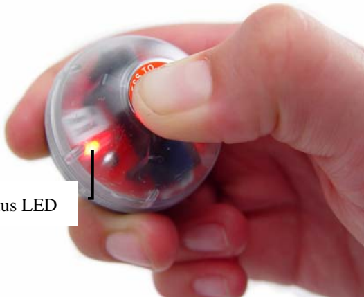
Figure 1 – to turn the transmitter ON, press down firmly on the top of the transmitter’s housing. The LED will illuminate. Keep pressing until the LED begins flashing. To turn the transmitter OFF, press and hold until the LED stops flashing.

During operation of the sonde, the LED will continue to flash.