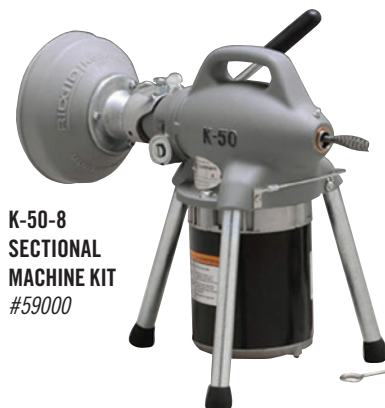
K-50-8 SECTIONAL MACHINE KIT #59000