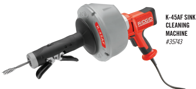
K-45AF SINK CLEANING MACHINE #35743