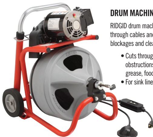
K-400 DRUM MACHINE #26993