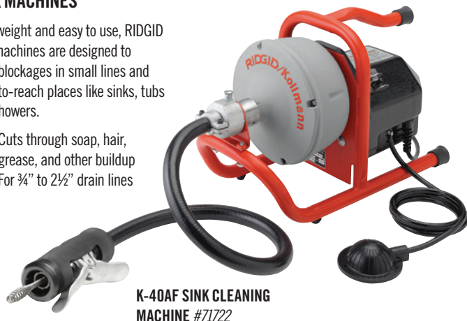
K-40AF SINK CLEANING MACHINE #71722