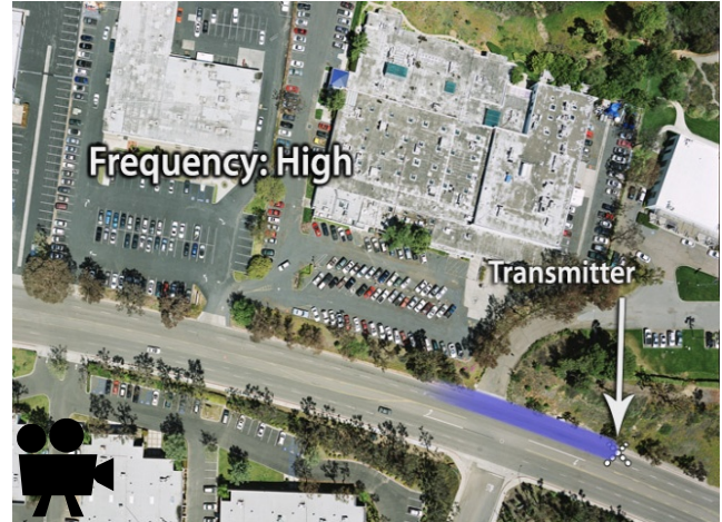
Click image to play video.