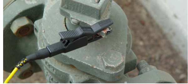
Good contact at the connection point aids current flow.

Solid metal-to-metal contact between the transmitter's clip lead and the connection point is essential for the efficient transfer of signal energy (current). Scrape away any paint, dirt, or corrosion, and work the clip's teeth into the connection point to get good metal-to-metal contact. The better the contact the less resistance there will be to current flow.