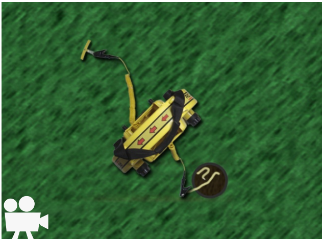
Basic locating circuit. Click image to play video clip.