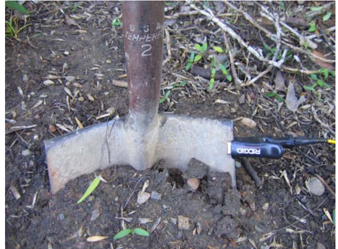
Like the antenna on a car, exposing more metal captures more signal.