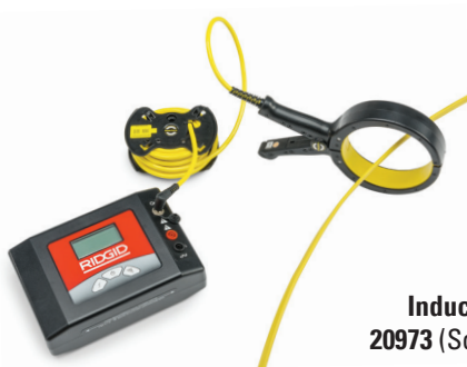
Inductive Clamp 20973 (Sold separately)