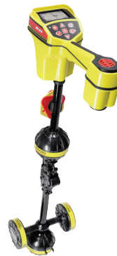
SR-24 Utility Locator 46393 (Sold separately)