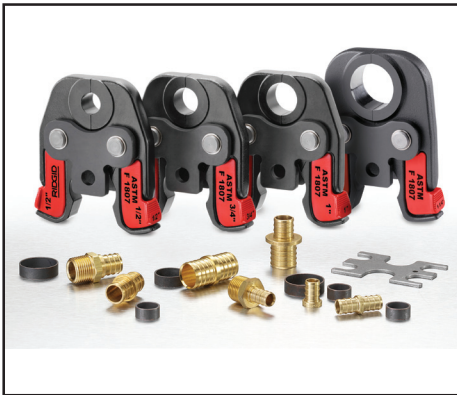
ASTM F 1807