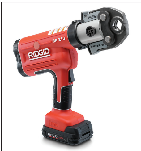
RP 210-B Press Tool