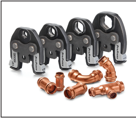
Compact Series ProPress® Jaws for Copper Tubing