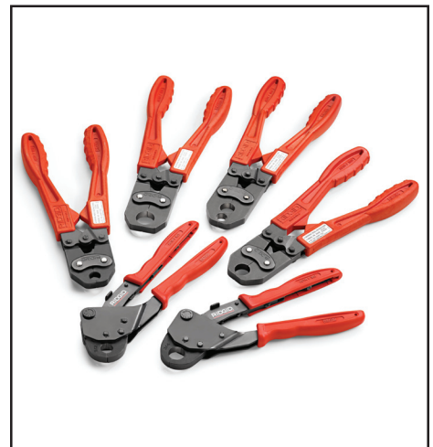
Manual PEX Crimp Tools

ProPress® is a registered trademark of Viega GmbH & Co. PureFlow® is a registered trademark of Viega LLC.