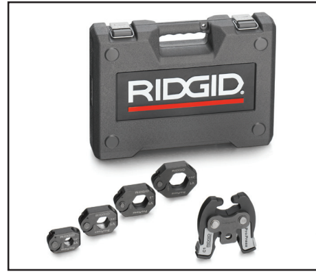
C1 ProPress® Ring Kit for Tight Spaces