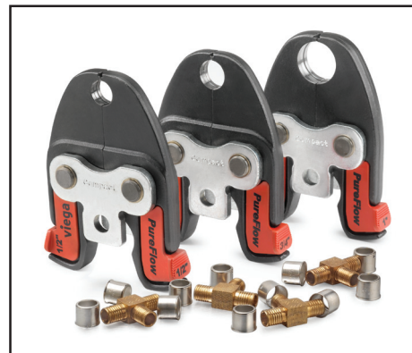
Compact Jaws for PureFlow® Jaws