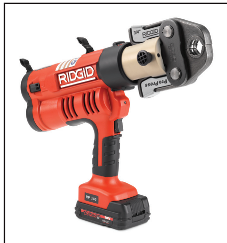
RP 340 Press Tool